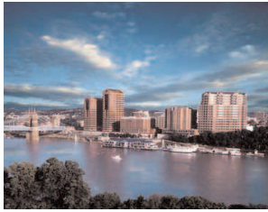
Downtown Covington, Kentucky as seen from Cincinnati