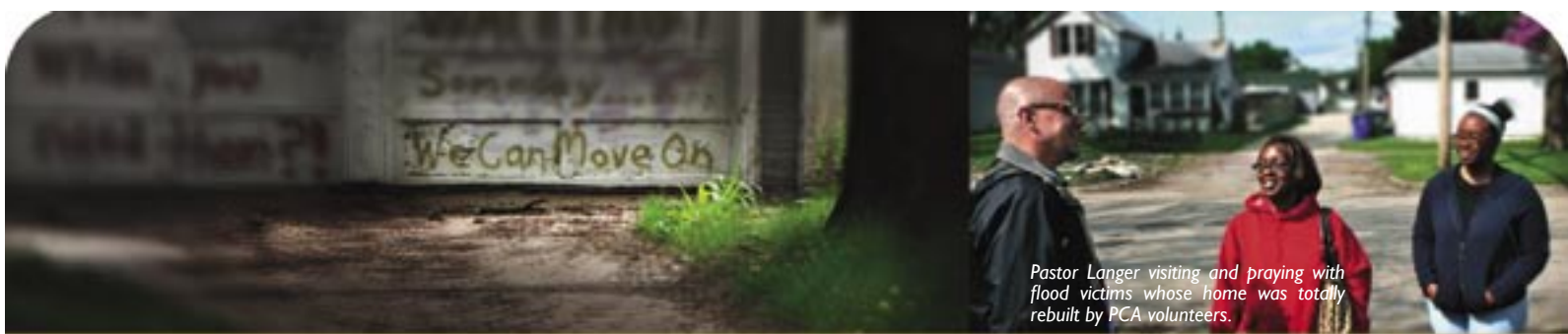
Pastor Langer visiting and praying with flood victims whose home was totally rebuilt by PCA volunteers.