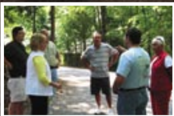
Recent planning for the upcoming March 2010 MNA Disaster Response Training.