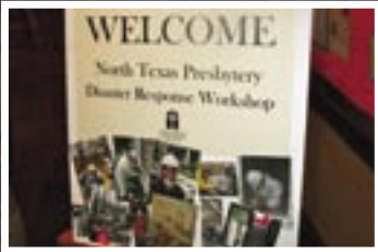
North Texas Presbytery Disaster Response Workshop.