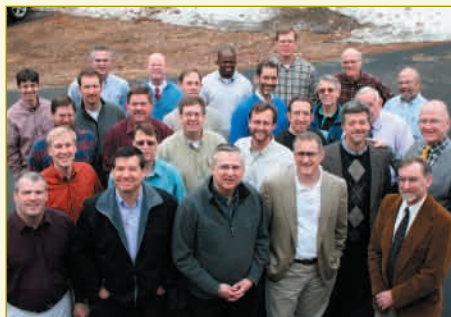
Northern New England Presbytery members

Christ the Redeemer in Portland is forming Gospel Friends of New England, a group encouraging Christians to pray for outreach to