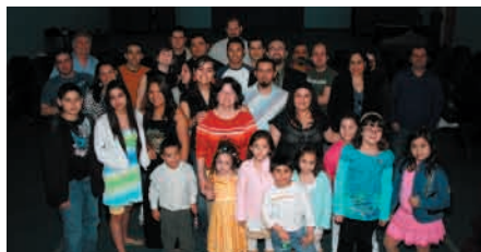
East Boston/daughter church

grown rapidly. "We're a multiethnic but monocultural church," he says. While Citylife includes over thirty ethnicities, most are young urban professionals. Citylife has a ten year vision to develop five different worship services in three different locations.