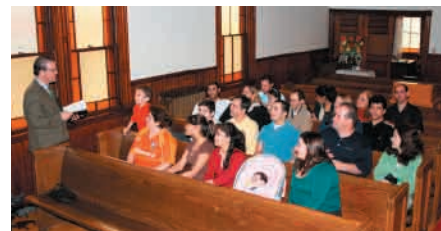
Christ the King Quincy/planted by East Boston