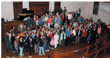
Christ the King Portuguese language/mother church