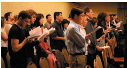
Citylife Boston/daughter church

The PCA Portuguese language congregations comprise mainly first generation Brazilian immigrants. Even though first generation immigrants wish to maintain a separate community, nevertheless they assimilate rapidly into American culture; this assimilation moves even more rapidly as children of new immigrants grow up in American culture speaking English as their primary language. "It's a constant discussion to see how to facilitate assimilation but honor the Brazilians' convictions that segregation means a