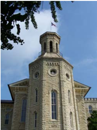
Wheaton College motto: "For Christ and His Kingdom"

C: 717.951.0051 shubach@pcanet.org www.pca-mna.org