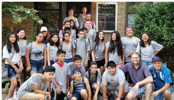
Former campers of City Camp, now in Leadership Training

Grace Fellowship Church has created a summer outreach art, music, and sports camp for area youth. Several PCA congregations have sent teams to NYC to help run the camp each summer. Over the years children who attended the camp grew up and are now helping to run the ministry. This is exactly how we build the next generation of leaders - through evangelism, discipleship, and entrusting them with