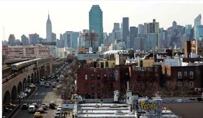
A view of Manhattan from Sunnyside, Queens