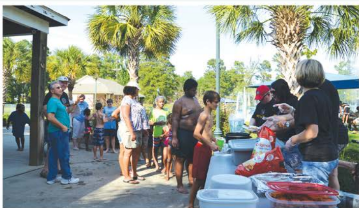
Back-to-school block party at the Orangeburg Spray Park

The PCA has a number of churches in South Carolina, but only a few have focused their ministry within the African American community. In fact there has been a history of exclusion and separation. By God's grace, those days are over! A small town might seem an insignificant place to do this kind of ministry, but this is exactly where it needs to be lived out. The Lord is at work, people are being brought together, and the gospel is being shared and demonstrated. This young church would benefit from a Thanksgiving Offering grant for leadership development.